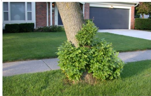
Epicormic sprouts growing at the base of an ash tree.