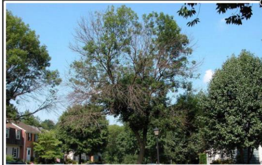
Canopy dieback and thinning begin in top one-third of canopy.